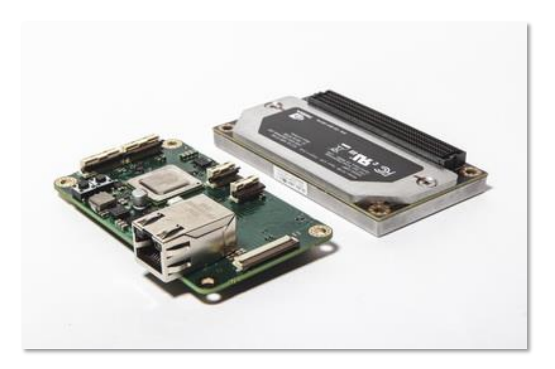
Pic.2 Jetson TX1 SoM and Phoxi carrier