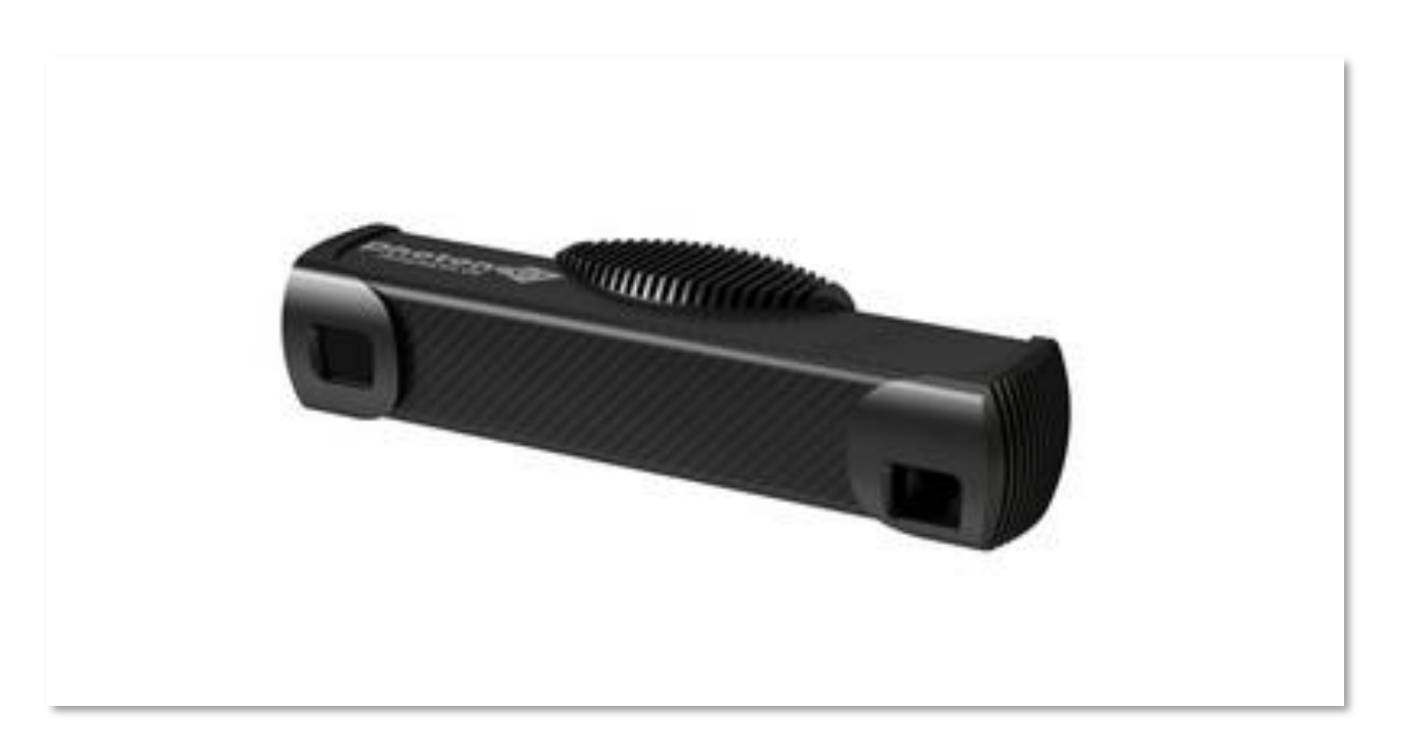
Pic.1 Photoneo PhoXi 3D scanner